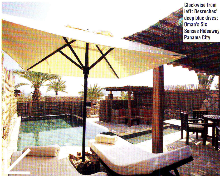
Clockwise from left: Desroches' deep blue dives; Oman's Six Senses Hideaway; Panama City

In terms of a balance between sea and scenery, relaxation and play, sailing Croatia's